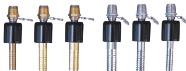
Ball Type Swivel Adapters