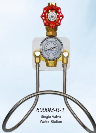
6000M-B-T Single Valve Water Station

"The World's Safest and Most Trusted Washdown Brand for Sanitizing Factories and Industrial Plants."