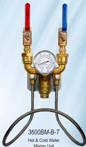
3600BM-B-T Hot & Cold Water Mixing Unit

Independent testing by industry experts rank SuperKlean Mixing Units #1 when comparing the top 5 competitors!