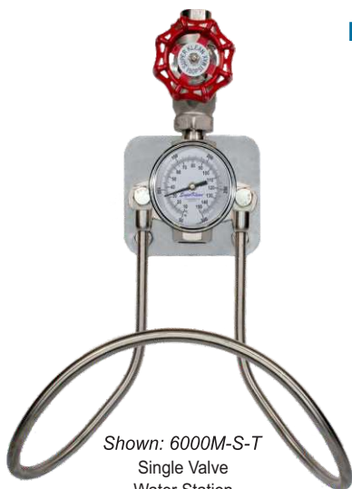
Shown: 6000M-S-T Single Valve Water Station

Provides a low-cost instantaneous readout of water temperature.