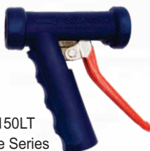
150LT Lite Series