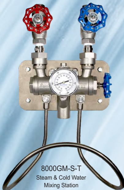
8000GM-S-T Steam & Cold Water Mixing Station

The industry's safest, most environmentally exceptional mixing stations.