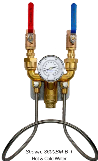
Shown: 3600BM-B-T Hot & Cold Water Mixing Unit

SuperKlean 3600's are always in stock, along with the washdown industry's best nozzles, adapters and hoses.