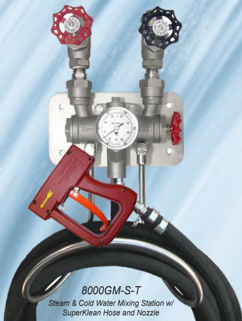
8000GM-S-T Steam & Cold Water Mixing Station w/ SuperKlean Hose and Nozzle

"The World's Safest and Most Trusted Washdown Brand for Sanitizing Factories and Industrial Plants."