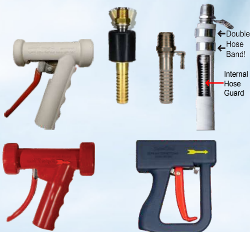
← Double Hose Band! Internal Hose Guard

The industry's safest, most environmentally exceptional mixing stations. Rated #1 in leading independent testing. Dangerous steam does not leak into or burst hoses, potentially injuring employees.