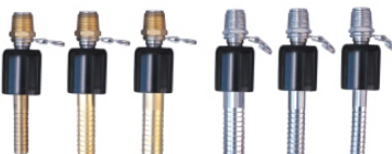
Ball Type Swivel Hose Adapters