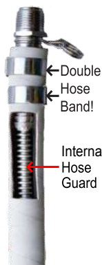
Double Hose Band!