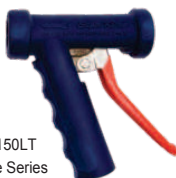
150LT Lite Series