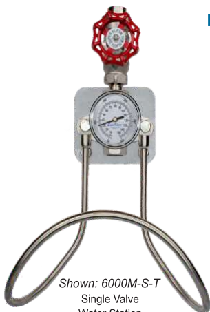
Shown: 6000M-S-T Single Valve Water Station

Provides a low-cost instantaneous readout of water temperature.