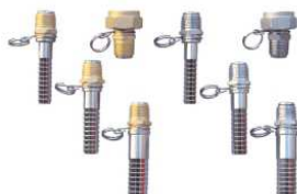
Swivel Hose Adapters