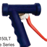
150LT Lite Series