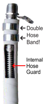
Double Hose Band!